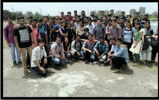
Sewerage Treatment Plant, Versova, Mumbai B.E. CIVIL