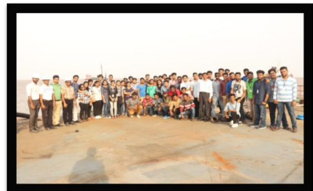
Supa Dam and Power House Dandeli Karnataka T.E. CIVIL on 03 rd Mar 2018