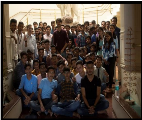
Gargoti Mineral Museum, Nashik, Maharashtra S.E. CIVIL on 13 th Oct 2017