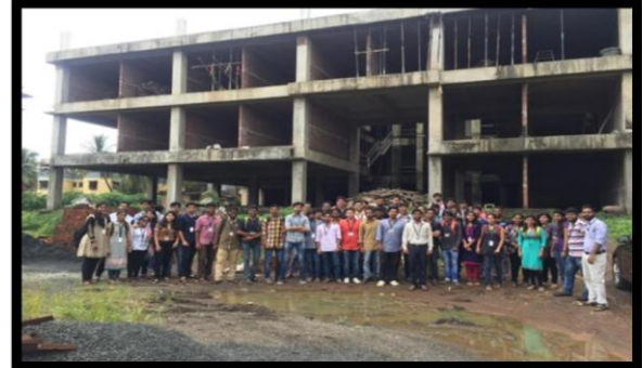
Commercial Complex of Rajyog Construction, Palghar T.E. CIVIL on 21 th Sep 2017