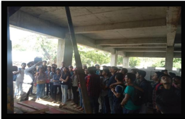
Commercial Complex of Sliver Stone, Palghar, T.E CIVIL 21th Sep2017