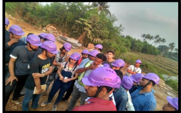
Design and construction of bridge across river mandovi , Panji Goa. T.E. CIVIL on 01 st Mar 2018