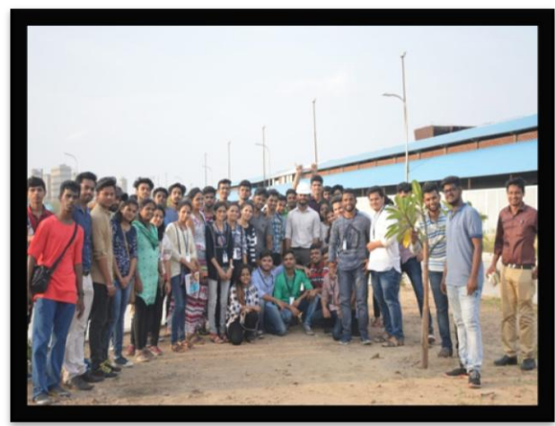
Adani Petronet Port Pvt Ltd Dahej , Gujarat, T.E. 22th Oct 2017