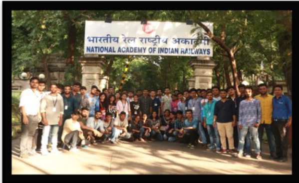
National Academy of Indian Railways, Vadodara T.E. CIVIL on 23 rd Oct 2017