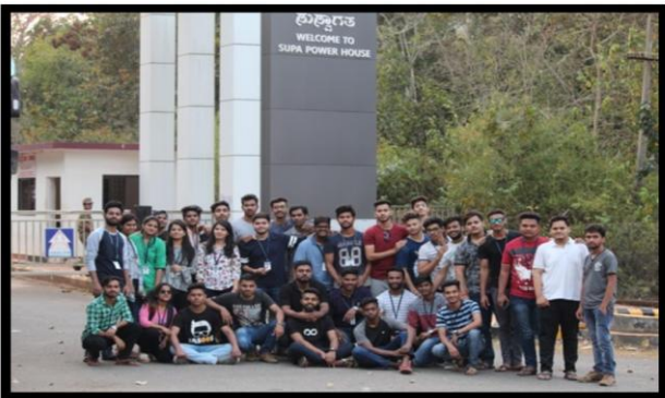
Supa Dam and Power House Dandeli Karnataka T.E. CIVIL on 03 rd Mar 2018