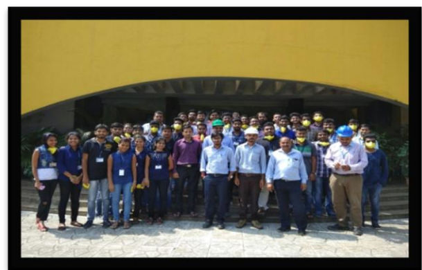
Mumbai Waste Management Ltd. Taloja Panvel, B.E CIVIL 09th Oct 2017