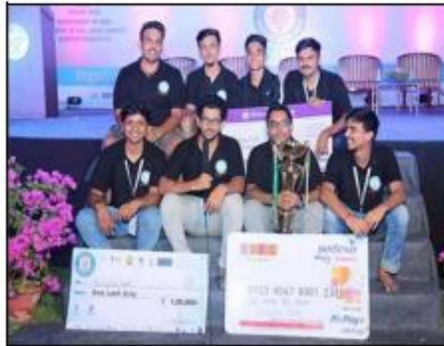
Team Rockstar Bots