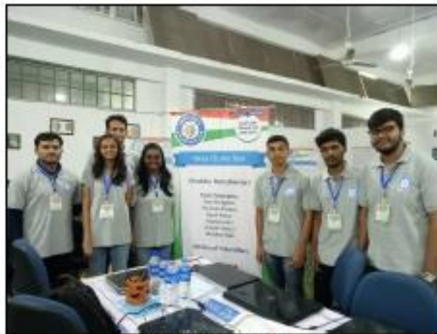
Team Ideas Outta Box